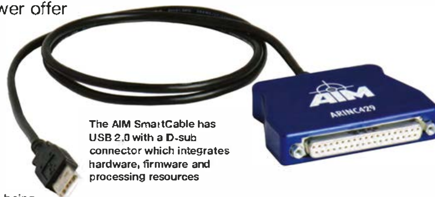
The AIM SmartCable has USB 2.0 with a D-sub connector which integrates hardware, firmware and processing resources

With flexible application software, the essential building blocks for a portable test set are now available and can be principally